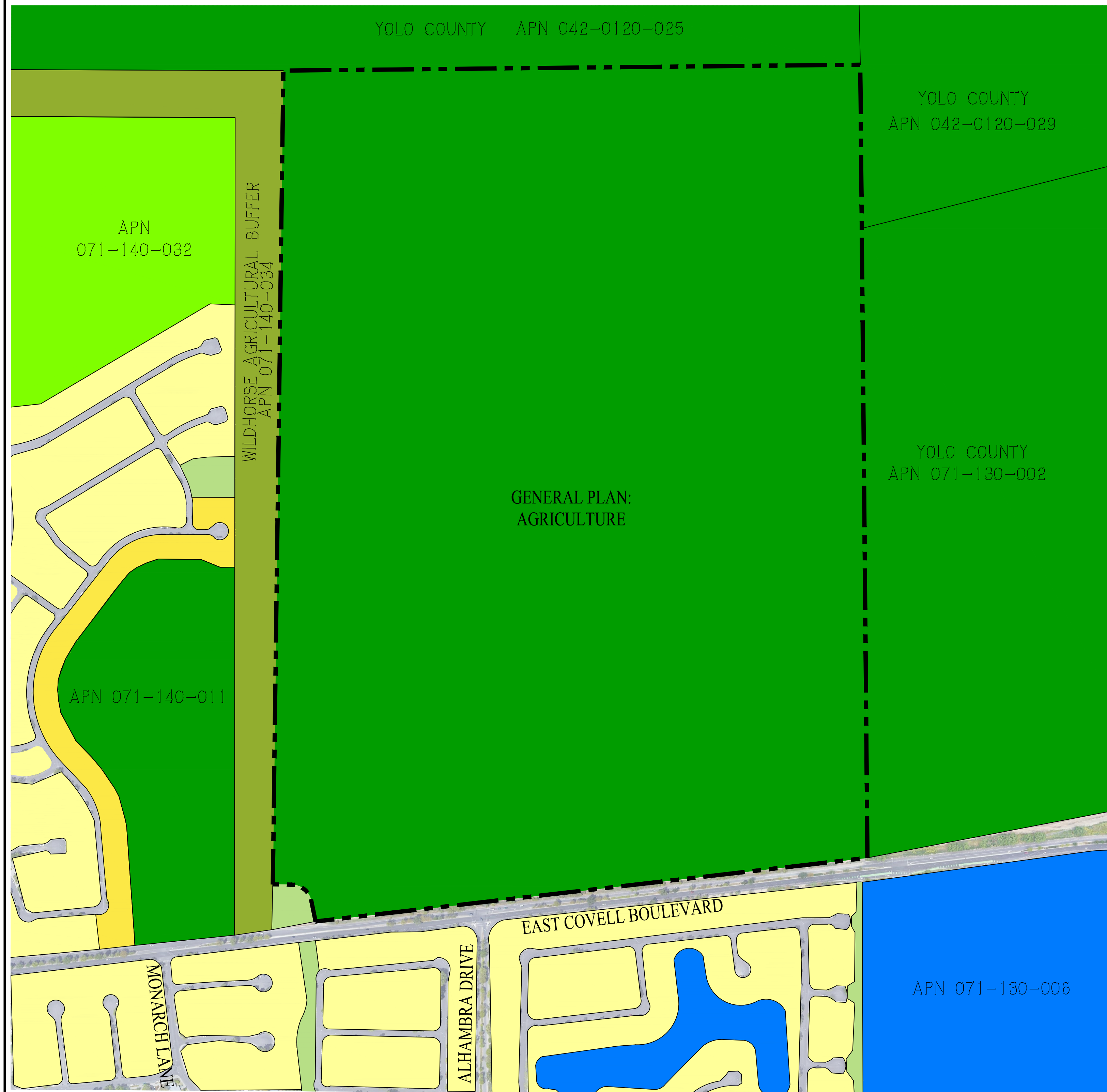
EXISTING GENERAL PLAN SCALE: 1"=300'