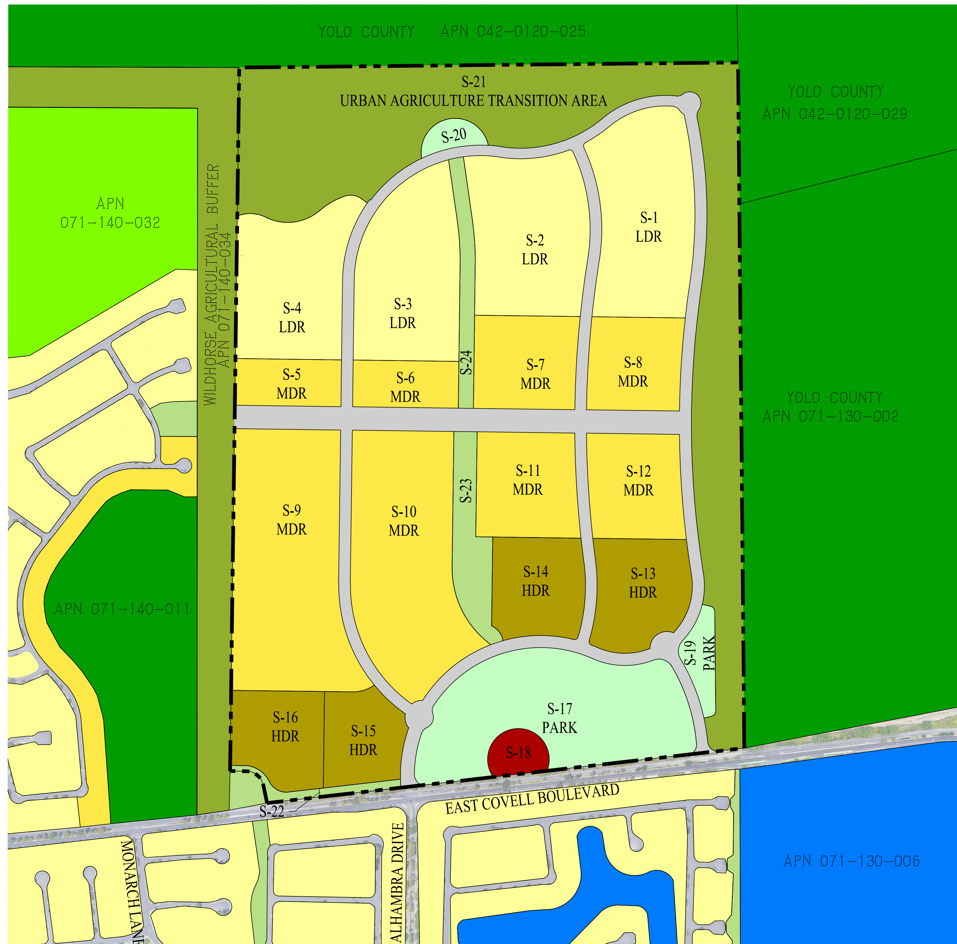
PROPOSED GENERAL PLAN AMENDMENT SCALE: 1"=300'